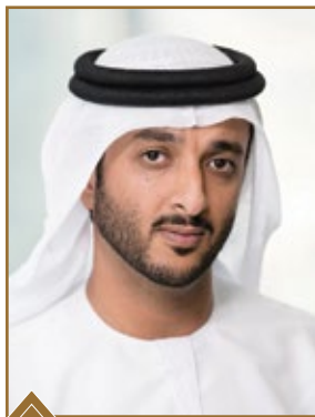
Abdullah bin Touq