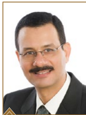
Dr. Ahmed Darweesh