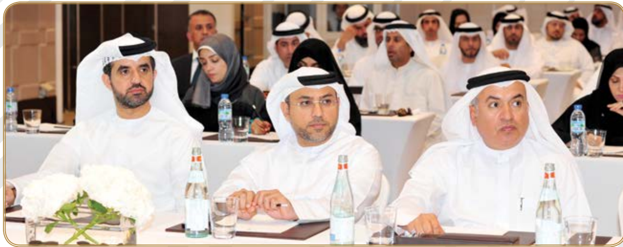
جانب من أحد ملتقيات نادي الموارد البشرية

Delegates from 1111 in Ajman Government viewing human resources projects and programs