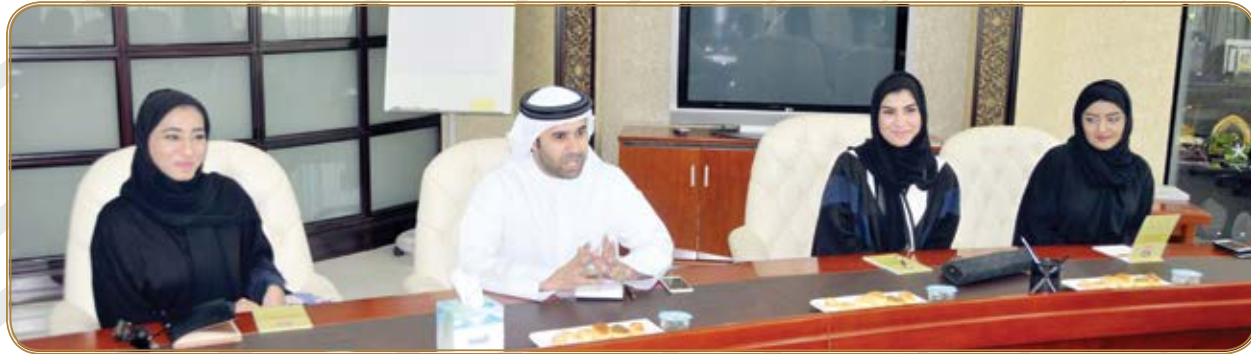
وفد من الإدارة المركزية لتنمية الموارد البشرية في حكومة عجمان يطلع على أنظمة ومشروعات الموارد البشرية الاتحادية

FAHR forms a team for knowledge management and conduct multiple internal meetings