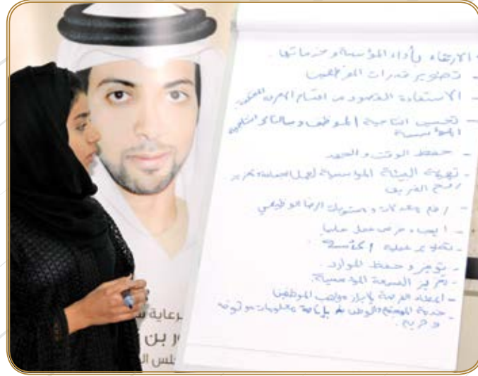
«الهيئة» تشكل فريقاً لإدارة المعرفة وتعدّد لقاءات داخلية عدة

FAHR forms a team for knowledge management and conduct multiple internal meetings