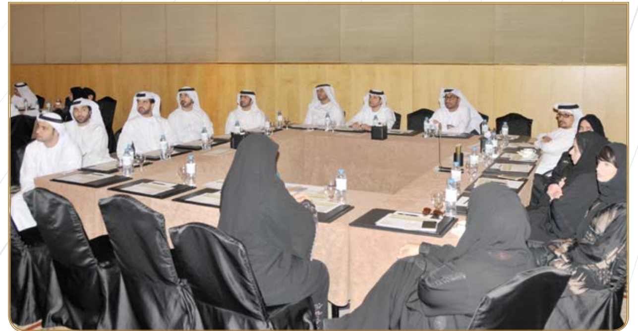
جلسة عصف ذهني حول الإجازات المرضية والإنتاجية في الحكومة الاتحادية

Brainstorming session on sick leaves and productivity in the federal government